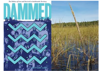
The politics of loss and survival in Anishinaabe territory

Wednesday, Oct. 21, 2020 | 11:30–12:30 pm via Zoom meeting