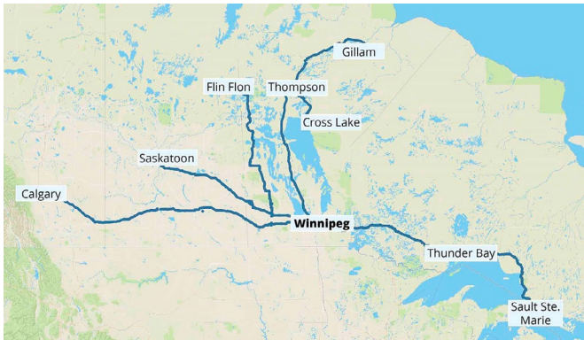
Figure 1: Greyhound Bus Routes in Manitoba, Summer 2018

Map published as part of Macintosh, Maggie and Larry Kusch. 2018. "Fallout from Greyhound departure," Winnipeg Free Press , 10 July 2018, https://www.winnipegfreepress.com/local/greyhound-exit-487822171.html