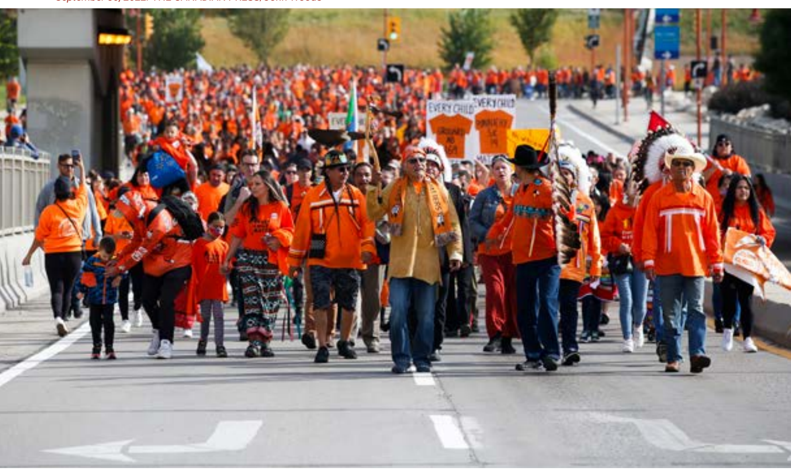
People attend the second annual Orange Shirt Day Survivors Walk and Pow Wow on National Day for Truth and Reconciliation in Winnipeg, Friday, September 30, 2022.

Second, this research shows how detailed analysis can be an effective tool in confronting the growing threat of residential school denialism and other kinds of misinformation and disinformation. as many Indigenous communities have called for (Office of the Special Interlocutor, 2023). Instead of ridicule and outrage — which can give denialists a larger platform — what is needed is deep and reasoned analysis of their discourse to show why they are wrong. This is the strategy of disempowering and discrediting residential school denialism advocated by TRC Chair Murray Sinclair (CBC News, 2017). We recommend that more research of this kind be undertaken to help Canadians learn how to identify and confront residential school denialism and support meaningful reconciliation. As the